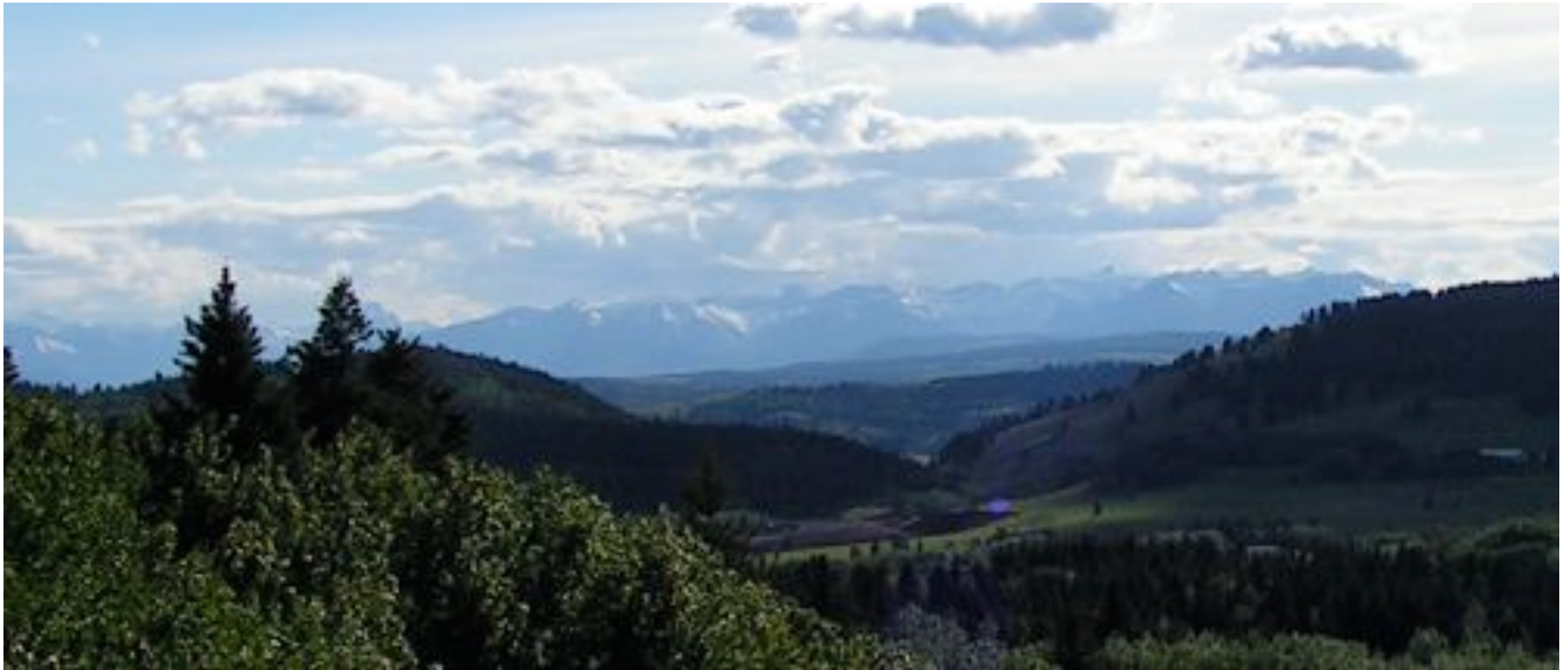
Top of Grand Valley – West of Cochrane