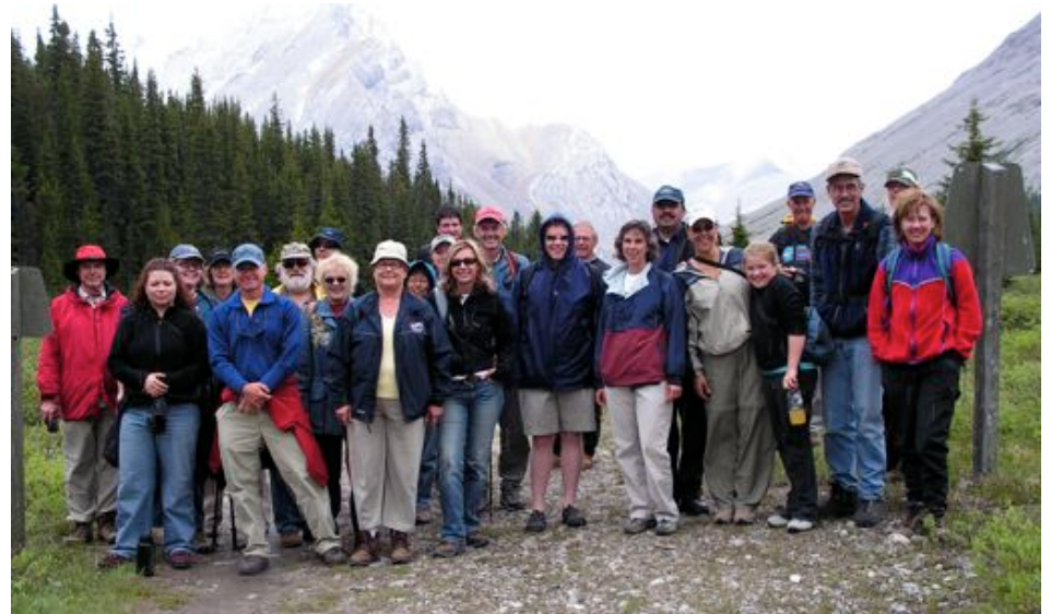
Elbow River Watershed Partnership