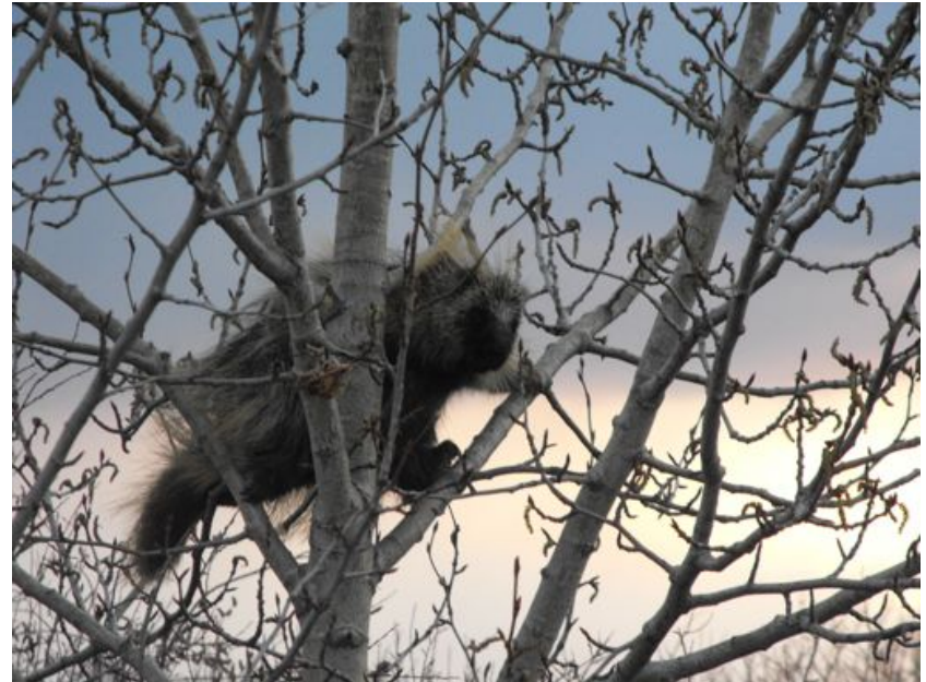
Prickles the Porcupine